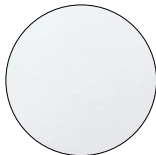
T21 RAL 9003 White