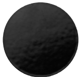
T21 RAL 9005 Black