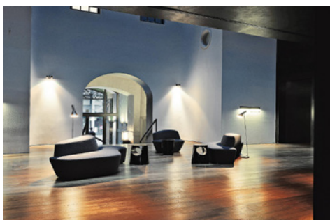
Alma Hotel (Barcelona, Spain)