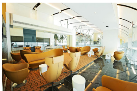
Muscat International Airport (Muscat, Oman)