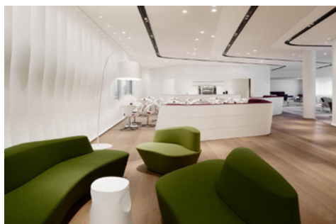
Bavaria Lounge, Messe München (Munich, Germany)