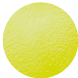
T22 RAL 1016 Gloss Yellow