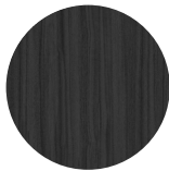
T122 Anthracite Grey