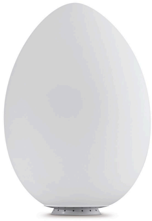
Table lamp with diffused and dimmable light. Diffuser made of white blown glass with satin-finish. Base made of white painted metal. Black power cable, plug and switch. European two-pole plug. Bulb not included.

A natural form and timeless symbol of perfection, in which symmetry and asymmetry harmoniously coexist. Designed in 1972, the 'shell' of the egg contained a light source: an ironic idea that still works today. As in nature, the shell of the Uovo lamp is the embodiment of absolute lightness, an elegant form in white satin blown glass that gives off a warm, uniform light. Available in three sizes, it has all the versatility of a collection designed for multiple uses: from the small version which serves as a tiny utility lamp to the large version, a veritable light sculpture, protagonist of any space.