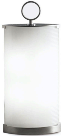
Table lamp with diffused and dimmable light. Frame made of nickel-plated metal. Diffuser made of curved pressed glass. Transparent power cable, dimmer and plug. European two-pole plug. Bulb not included.

Pirellone and Pirellina have been lighting classics for 40 years. Two pieces of curved glass held in place by metal elements at the base and the top: the secret of this simple structure lies in the use of special impact-resistant glass.