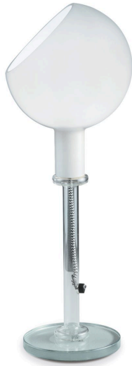
Table lamp with diffused and dimmable light. Borosilicate glass frame. Diffuser made of glossy and coloured blown glass paste. Transparent bevelled glass base. Braided fabric cable, black dimmer and plug. European two-pole plug. Bulb not included.

Designed by Gae Aulenti and Piero Castiglioni in 1980, the Parola lamp features three different kinds of glass working processes: blown glass, natural glass and natural crystal. It is an exemplary model of technical integration between artisan and industrial skills.