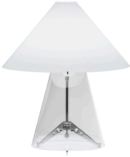
Table lamp with diffused and dimmable light. Chromed metal frame. Transparent blown glass base. Diffuser made of colored glass paste with frosted and blown glass. Transparent power cable, dimmer and plug. European two-pole plug. Bulb not included.

Metafora was born in the flourishing creative climate of the early '80s, when Gae Aulenti took on the role of artistic director for FontanaArte and decided to bring glass back to the forefront of the company's production. On Aulenti's invitation, Umberto Riva designed a precious table lamp consisting of a conical shade in layered opal glass supported by a transparent glass base that hides the metal frame, all interlocking. A highly decorative object, produced with traditional techniques like glass blowing and other examples of artisanal know-how, repropoed today to a clientele ever more attentive to originality of design and its timeless expressions.