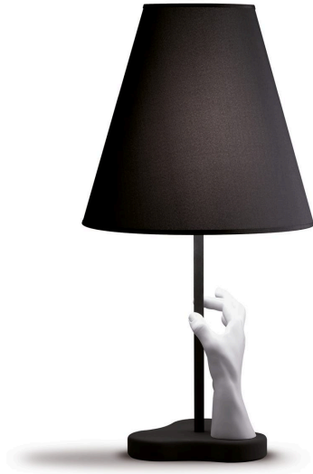
Table lamp with diffused and dimmable light. Base made of marble powder and resin, stem made of metal with square section, both painted in soft-touch. Hand made of marble powder and resin. Diffuser made of black fabric lined with white PVC. Black power cable, dimmer and plug. European two-pole plug. Bulb not included.

An ironic and elegant lamp designed by Pietro Chiesa in 1932, the year in which he began his project of artistic direction in FontanaArte, shared with Gio Ponti. Pioneer of irony and originality for those times, Mano is still among the most sought after pieces by design enthusiasts all over the world.