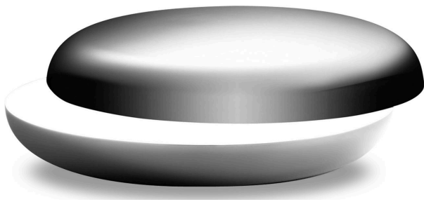
Table lamp with adjustable light through rotation of the top part. Glossy metal frame. Transparent power cable, switch and plug. European two-pole plug.

A luminous object with unique appeal. The upper part of the body rotates to allow complete management of the intensity of the light. Loop can be put on a table or on the floor.