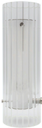
Table lamp with diffused light. Metal structure. External diffuser in borosilicate glass available in four different finishes: transparent striped, sandblasted, pink painted, smoked painted. Internal diffuser in painted borosilicate glass. Black power cord, dimmer and plug. Power supply on plug with interchangeable plug (uk - usa - europe - australia). Integrated Led.

FontanaArte calls Stefano Boeri Architetti and launches "lasospesa", the new table lamp. For one of the most important Milanese architects in the world, whose Bosco Verticale is one of the most representative and iconic projects of our time, trying a lamp was an interesting change of scale. Like FontanaArte: historic and contemporary Milan, elegant entrances and new buildings, fashion and major art exhibitions. Like FontanaArte's art: it finds form in an object that does not preclude function and from which a light comes to life. lasospesa is in fact a symmetrical table lamp, born from the elementary principle of the incorporation of two cylinders: a cylinder of primary light suspended in a cylinder of diffused light. "A non-lamp with numerous uses and iridescent luminosity, very simple and classic, lasospesa seems to have always been there, where you placed it" says Stefano Boeri.