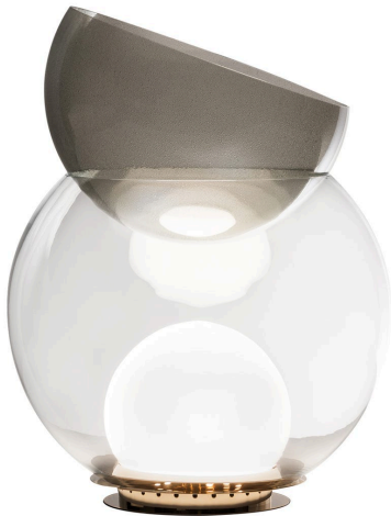
Table lamp with diffused light not dimmable. Galvanized metal frame. Middle globe made of transparent blown glass. Inner globe made of glossy white blown glass. Top half-sphere made of transparent and coloured blown glass with decorative bubbles. Black power cable, switch and plug. European two-pole plug. Bulb not included.

Half vase, half lamp, Giova marks the debut of Gae Aulenti in the field of lighting design. Available in two sizes, it is both a lamp and a luminous sculpture. Positioned on a metal base is a transparent bowl containing a sphere, which in turn houses the light source. Placed above is a smaller bowl in blown pulegoso glass, meaning 'with irregular bubbles', which serves as a bottom vase.