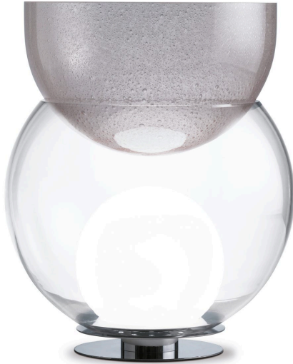
Table lamp with diffused light not dimmable. Chromed metal frame. Middle globe made of transparent blown glass. Inner globe made of glossy white blown glass. Top half-sphere made of transparent and coloured blown glass with decorative bubbles. Black power cable, switch and plug. European two-pole plug. Bulb not included.

Half vase, half lamp, Giova marks the debut of Gae Aulenti in the field of lighting design. Available in two sizes, it is both a lamp and a luminous sculpture. Positioned on a metal base is a transparent bowl containing a sphere, which in turn houses the light source. Placed above is a smaller bowl in blown pulegoso glass, meaning 'with irregular bubbles', which serves as a bottom vase.