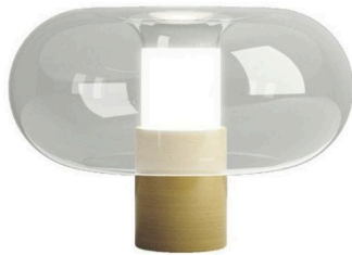
Table lamp with dimmable diffused light. Galvanized metal frame. Borosilicate blown glass diffuser. Transparent power cable, dimmer and plug. European type plug two poles. Light source not included.

Two materials: metal and glass, as in the historic tradition of FontanaArte. The metal acts as a base and contains the light source while the glass, the true protagonist of the project, is expertly worked by skilled craftsmen in a process of fusion between a portion of transparent glass and a satin one from which the light diffuses. Fontanella is formed by the union of two glasses: the internal tube is threaded, sandblasted and finally joined with the bubble-shaped blown glass. What makes the processing particularly refined is the manual joining of the two parts, which requires the skillful technique of a craftsman. Furthermore, the glass, which has always been the material par excellence of the FontanaArte product, is the most crystalline on the market. The use of light bulbs, dimmable and not dimmable, for the biggest energy saving, complete the contemporaneity of this FontanaArte piece.