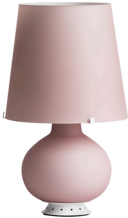
Table lamp with diffused light not dimmable, double light controls. The double light switch allows to illuminate the diffuser and the base separately. Painted metal frame. Diffuser and base made of blown satin-finish glass and colored paste. Black power cable, plug and switch. Two-poles UEuropean plug. Bulb not included.