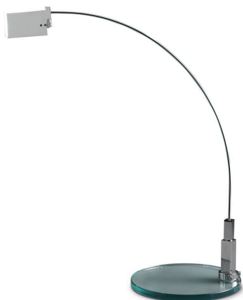
Table lamp directional light and double light intensity not dimmable. Frame made of chromed metal with 360° adjustable body. Cut float glass base. Pivoting diffuser fins made of anodized aluminium. Protection screen of the bulb made of sandblasted glass. Electrical connection between base and body through jack. Black power cable, switch and plug. European two-pole plug power supply. Bulb not included.

Lightness and elegance for this family of lamps designed by Alvaro Siza and available in floor, table and wall versions. Adjustable body and diffuser wings for complete management of light.