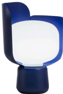
Table lamp with diffused light adjustable by moving the petals. Frame made of painted aluminium with polycarbonate petals. Diffuser made of milk-white and opaline polyethylene. Transparent power cable, plug and switch. European two-pole plug. Bulb not included.

Blom is a small table lamp by Andreas Engesvik, a Norwegian designer who has made a name for himself on the international scene thanks to his ability to instil emotions, appeal and ideas into everyday objects. Taking up very little space, just 24 cm tall with a diameter of 15 cm, Blom is a light, fun lamp that is easy to pick up and move and suitable for any purpose. Its name, a contraction of the word blomst, which in Norwegian means flower, is inspired by its petal shaped blades. Intensity can be adjusted thanks to the two petals that gently embrace the diffuser, rotating on the base to shield the glare depending on personal requirements: with the petals aligned the lamp emits maximum light. The compact fluorescent bulb guarantees good effective lighting with low energy consumption. The metal base ensures stability for the lamp and when lit, the polycarbonate petals maintain a temperature that permits touching without the risk of burns. Blom is an article that adapts perfectly to contemporary living trends, at home on a table in the lounge or even by a bedside.