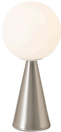
Table lamp with diffused light and dimmable by switch button. Brushed brass frame. Diffuser made of white blown glass with satin-finish. Black power cable, dimmer and plug. Plug-in power supply with interchangeable plugs (UK - USA - UE-CHN). Integrated led.

Nothing more than a sphere, set in an apparently impossible feat of balance, upon a cone that serves as the base. One of Gio Ponti's many compositional magic tricks, designed in 1932. The counterbalancing of two elementary geometric forms results in an original, perfectly proportioned object. An unpretentious composition, enriched by the extraordinary balance of its proportions and the stylish discretion of non-reflective materials. The light is diffused and valorized by the geometrical simplicity of the design. In designing Bilia, Gio Ponti imagined a smaller version in a range of "spray colours". From those handwritten notes of the original project, FontanaArte presents Bilia Mini in new breathtaking chromatic variations.