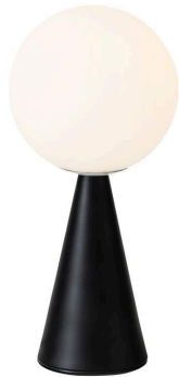
Table lamp with diffused light not dimmable. Painted metal frame. Diffuser made of white blown glass with satin-finish. Transparent power cable, plug and switch. European two-pole plug. Bulb not included.

Nothing more than a sphere, set in an apparently impossible feat of balance, upon a cone that serves as the base. One of Gio Ponti's many compositional magic tricks, designed in 1932. The counterbalancing of two elementary geometric forms results in an original, perfectly proportioned object. An unpretentious composition, enriched by the extraordinary balance of its proportions and the stylish discretion of non-reflective materials. The light is diffused and valorized by the geometrical simplicity of the design. In designing Bilia, Gio Ponti imagined a smaller version in a range of "spray colours". From those handwritten notes of the original project, FontanaArte presents Bilia Mini in new breathtaking chromatic variations.