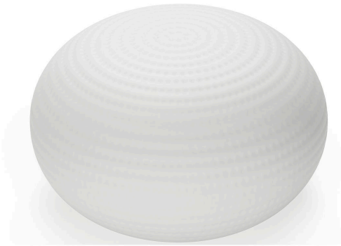
Table lamp with diffused and button-dimmable light. Milk-white diffuser made of blown glass with satin-finish. Painted metal frame. Transparent power cable, dimmer and plug. European two-pole plug. Bulb not included.

Bianca is a family of luminaires with the decoration on the diffuser surface features an orderly series of shallow delicate grooves etched into the white glass, yielding an effect resembling small footprints on fresh snow. Mouth blown, belt sanded and dipped in acid to obtain the distinctive 'silk effect' typical of fine glassware, Bianca diffusers are available in three different diameters to complete all thirteen types of luminaires belonging to the family. The largest diffuser has a 50 cm diameter and, owing to its dimensions and the amount of glass involved, continues to pose a considerable challenge even for the ablest of glassblowers trained in the fixed-mould blowing technique, which – according to the traditional Venetian production process – is performed without any external aids for turning and shaping the glass blob inside the mould, but relies solely on the glassblower's skill and lung capacity. Bianca is available in the following versions: table-top without stem, floor-standing with base and stem, pendant, wall-mounted and ceiling-mounted. The matt white coating applied to the various metal supports evokes the name and colour of the diffuser. Bianca produces a very warm, diffused and enveloping light emission in the surrounding environment.