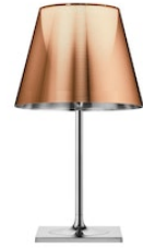
Table luminaire providing diffused lighting. Base, rod support and diffuser support in diecast, polished and chrome-plated Zamak alloy. Base cover in black injection-molded PA (Nylon). Injection-molded PC (polycarbonate) opal inner diffuser. Outer diffusers in transparent or fumée PMMA (polymethylmethacrylate), and silver or bronze on the inner surface, by vacuum aluminum coating. Injection-molded PC (polycarbonate) upper ring, completely transparent or transparent diffuser and silver diffuser) or transparent brown for the outer bronze diffuser.