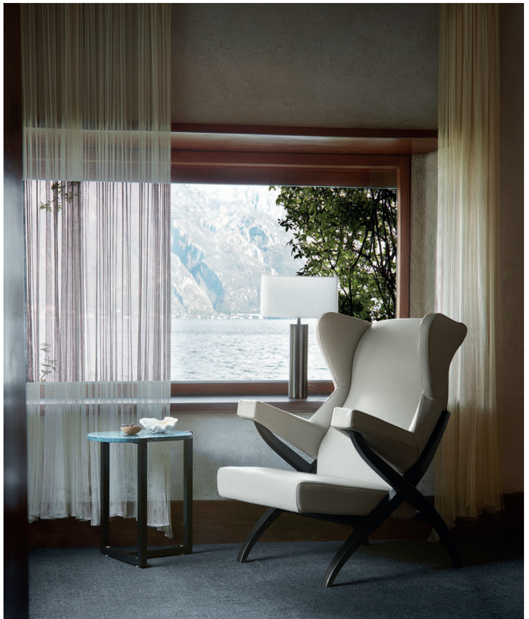
Fiorenza armchair Sigmund small table