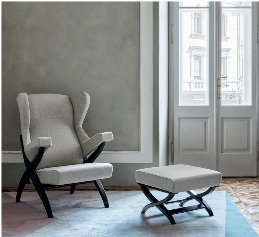
Fiorenza armchair Pouf