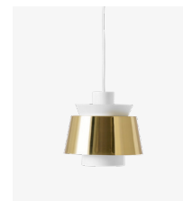
→ Brass & White