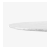
→ Bianco Carrera Marble