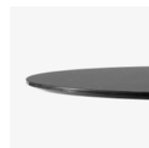
→ Nero Marquina Marble