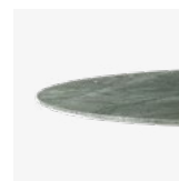
→ Verde Guatemala Marble