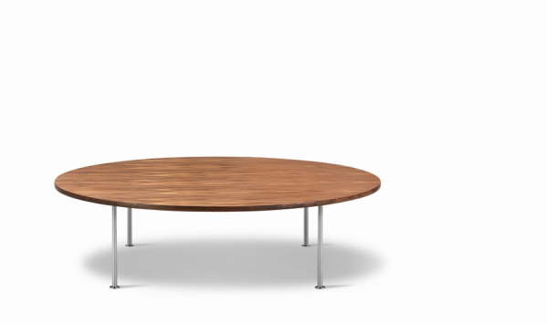
Table top in veneer as per original designed construction. Core of MDF. Edge in solid wood. Always mounted with plastic glides. Avaliable in two heights, please specify height.